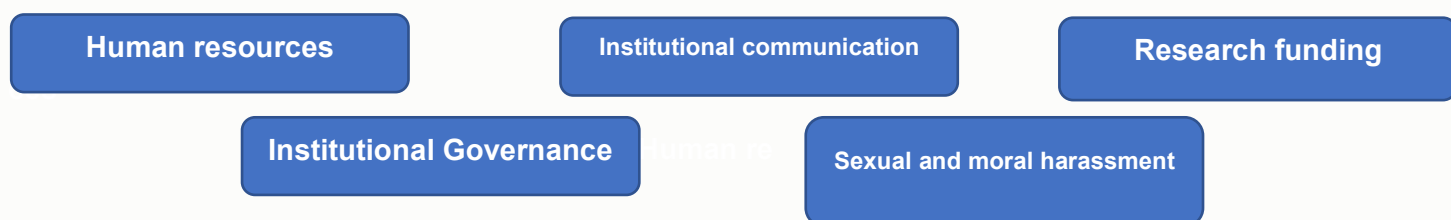
Table with proposed measures organized by topic